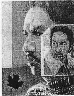
Norval Morrisseau R.C.A., C.M., R.S.C. (1931 - 2007)