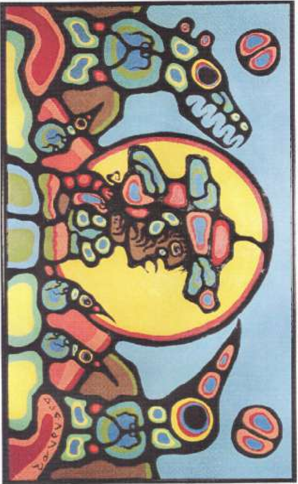
ARTIST: NORVAL MORRISSEAU SIZE: 28.5" X 50.5"