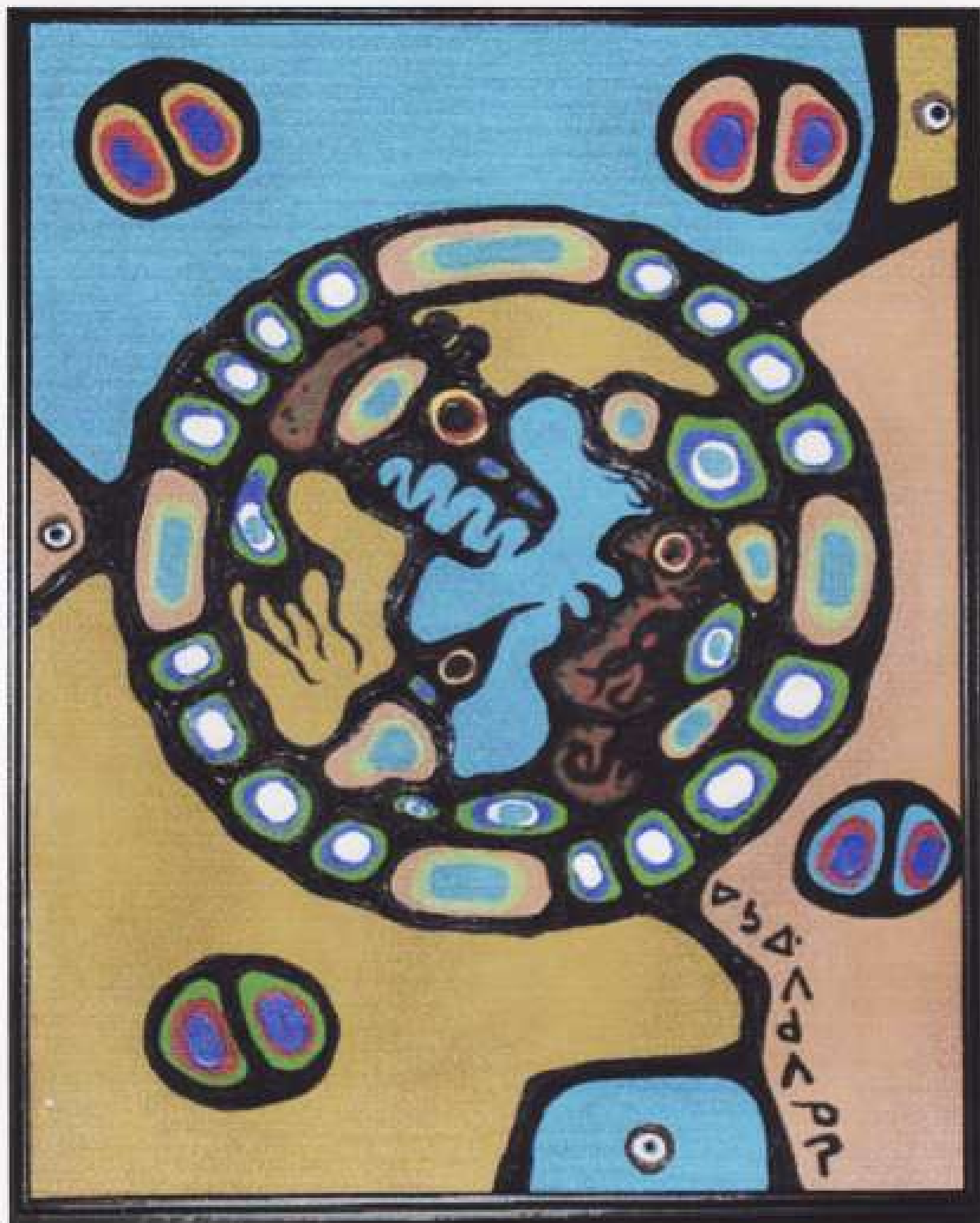
ARTIST: NORVAL MORRISSEAU SIZE: 29.5" X 22.5"