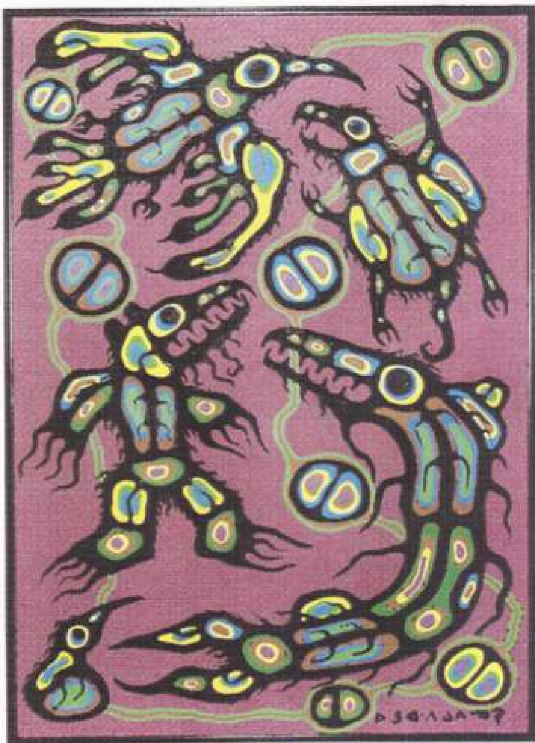
ARTIST: NORVAL MORRISSEAU SIZE: 56.5" X 34"