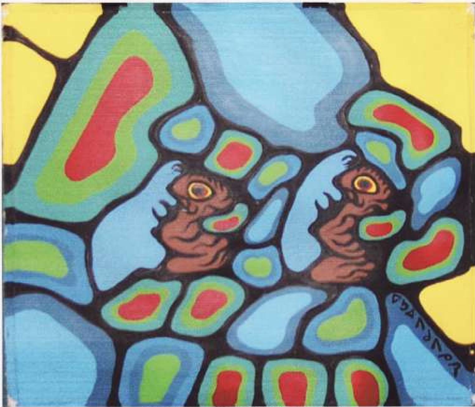
ARTIST: NORVAL MORRISSEAU 1977 SIZE: 32.5" X 36"