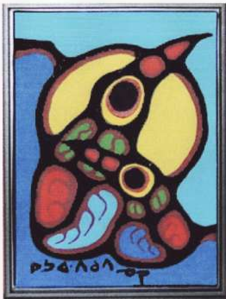
ARTIST: DORVAL MORRISSEAU SIZE: 17.5" X 12"