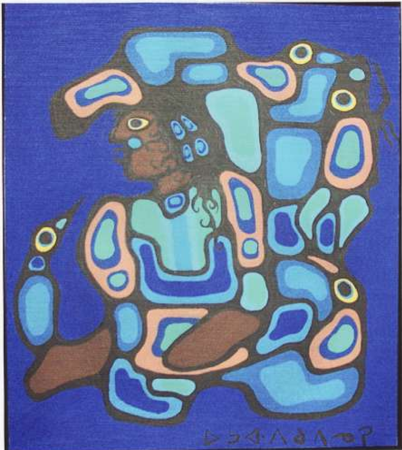
ARTIST: NORVAL MORRISSEAU SIZE: 51.5"X 43"