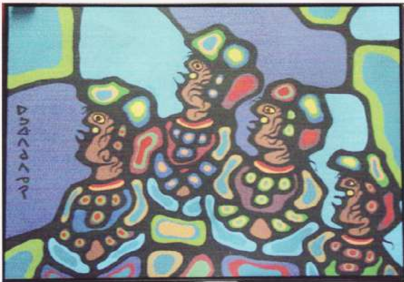
ARTIST: NORVAL MORRISSEAU SIZE: 37" X 51"