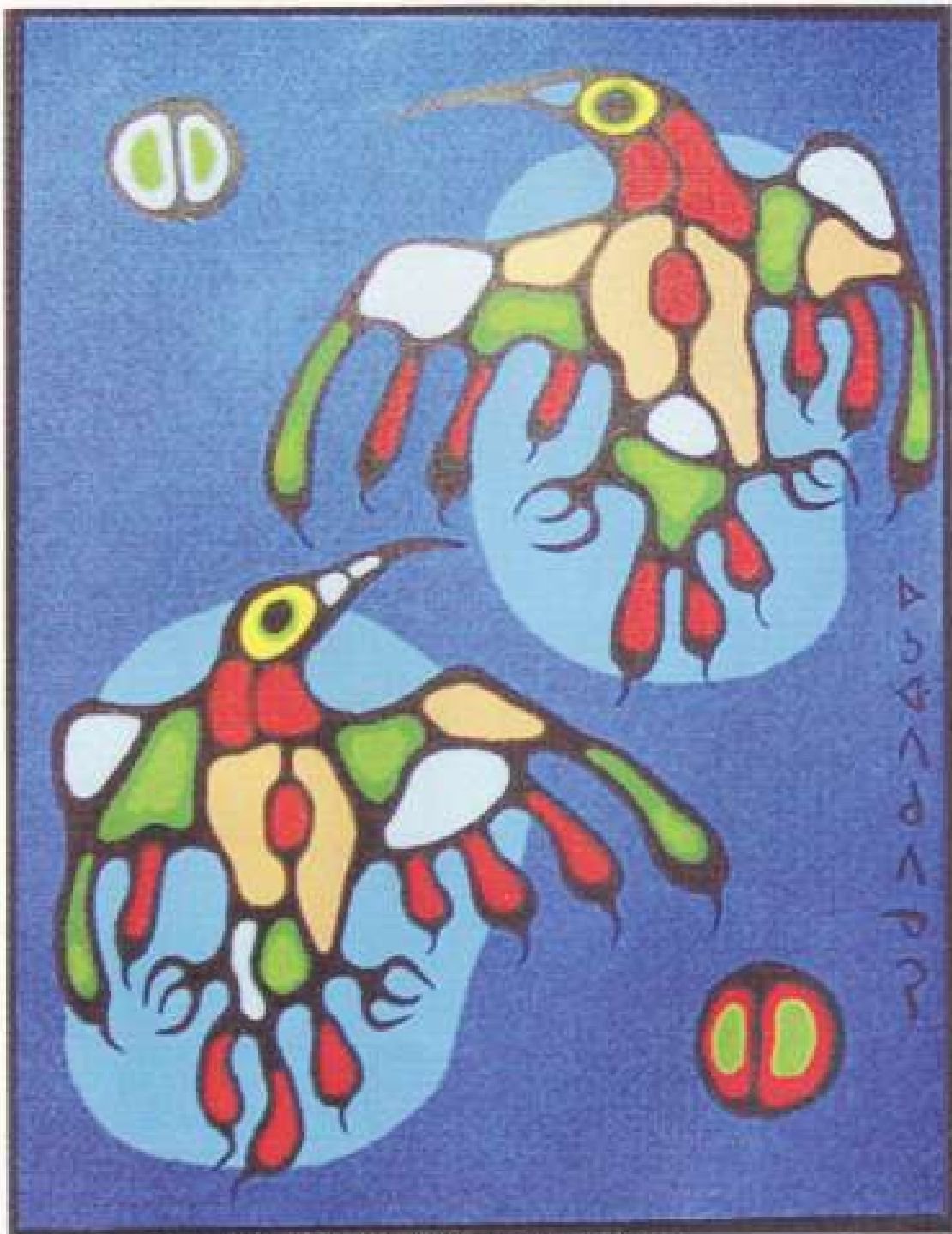
ARTIST: NORVAL MORRISSEAU SIZE: 59"X43"