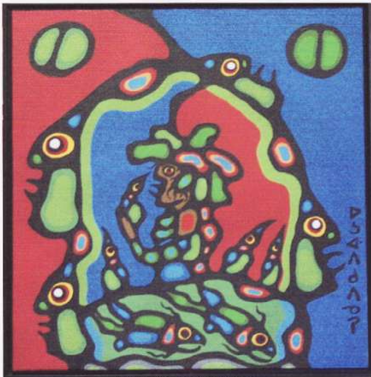
ARTIST: NORVAL MORRISSEAU SIZE: 29.5"X 27.5"