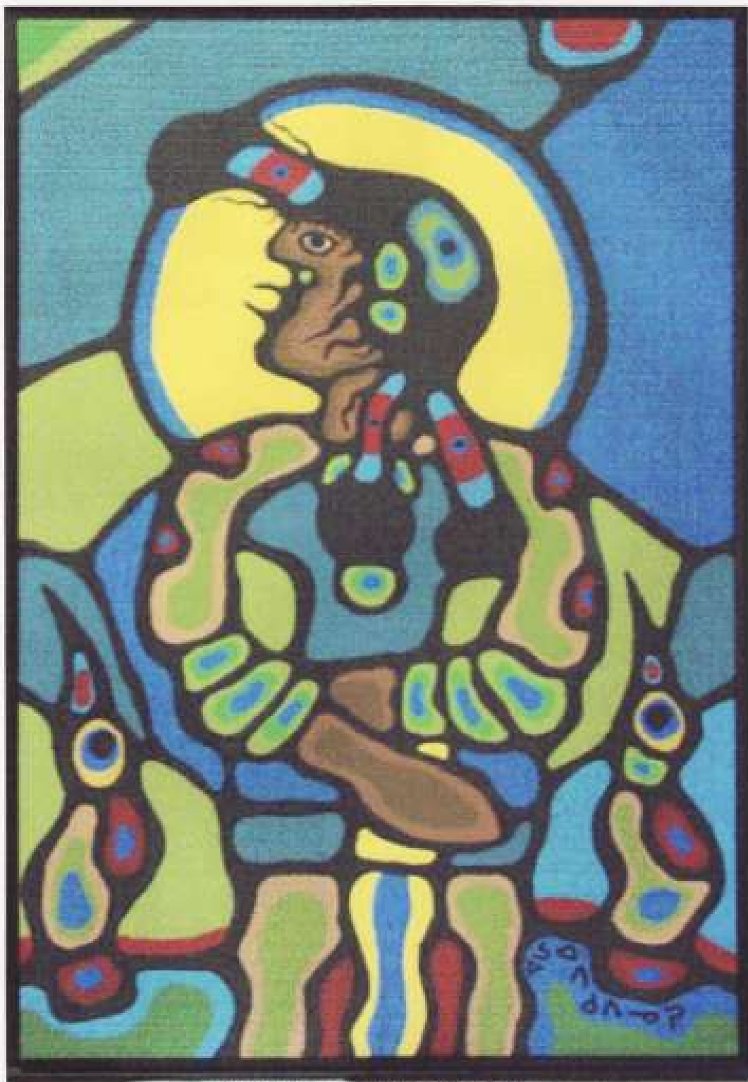
ARTIST: NORVAL MORRISSEAU SIZE: 40.5" X 26.5"