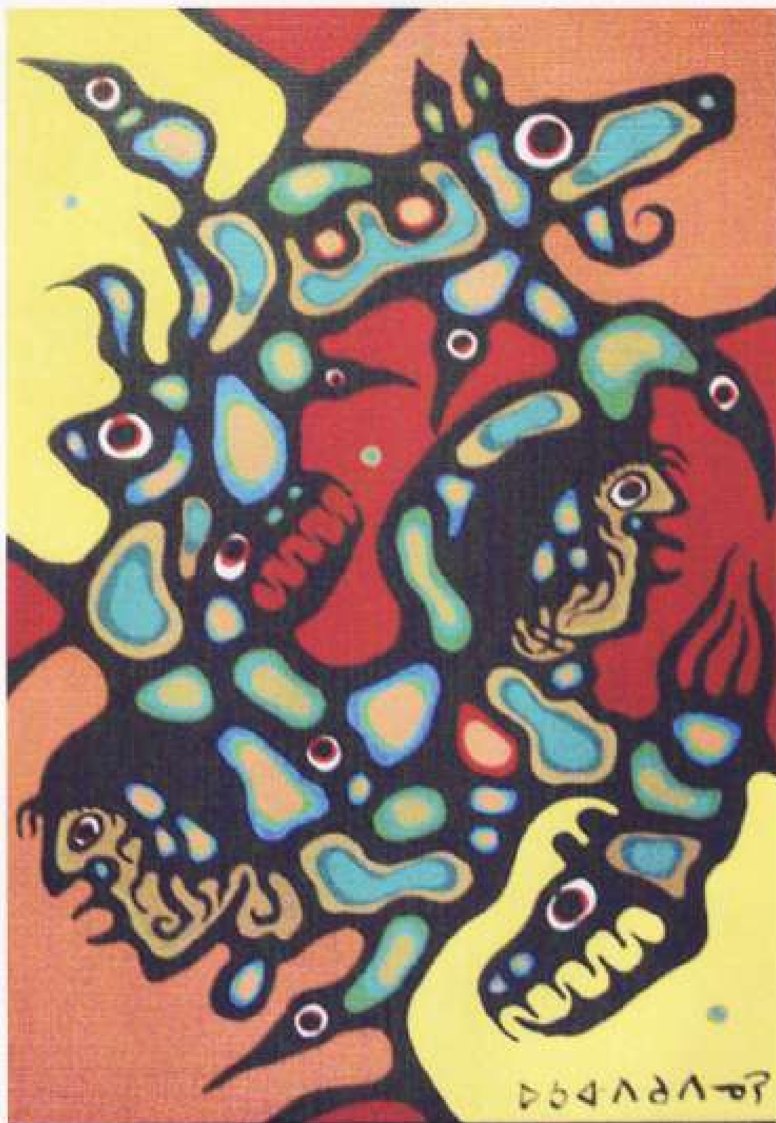
ARTIST: NORVAL MORRISSEAU SIZE: 51"X 33.5"