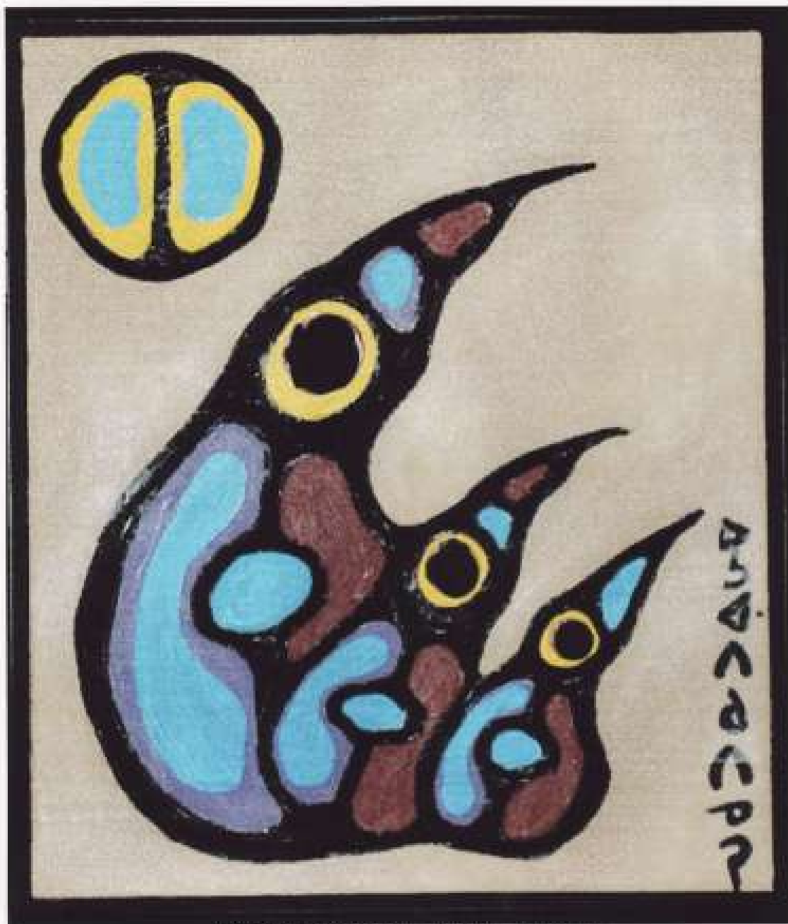
ARTIST: NORVAL MORRISSEAU SIZE: 24" X 19.5"