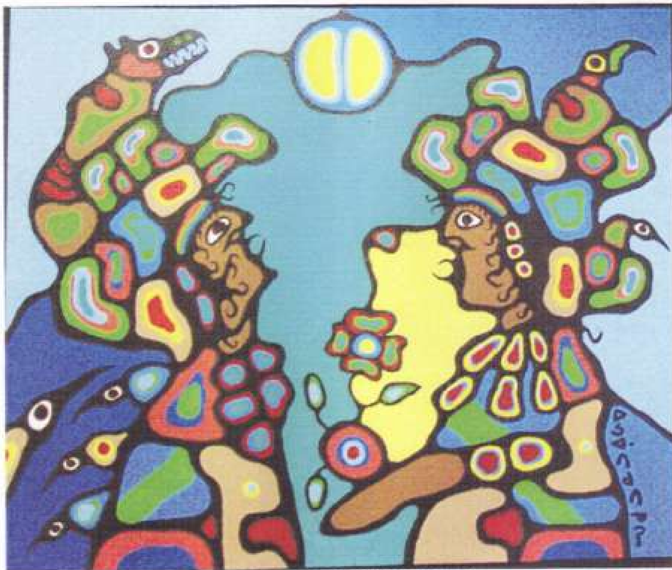
ARTIST: NORVAL MORRISSEAU SIZE: 52"X57"