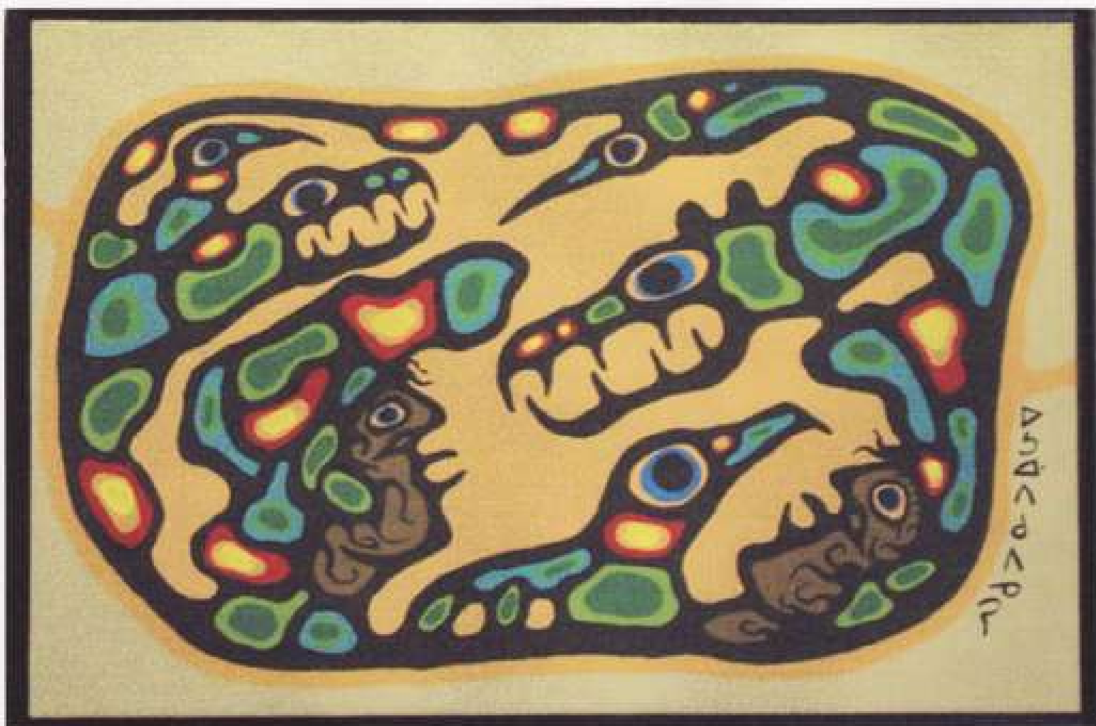
ARTIST: NORVAL MORRISSEAU SIZE: 27.15"X 39"