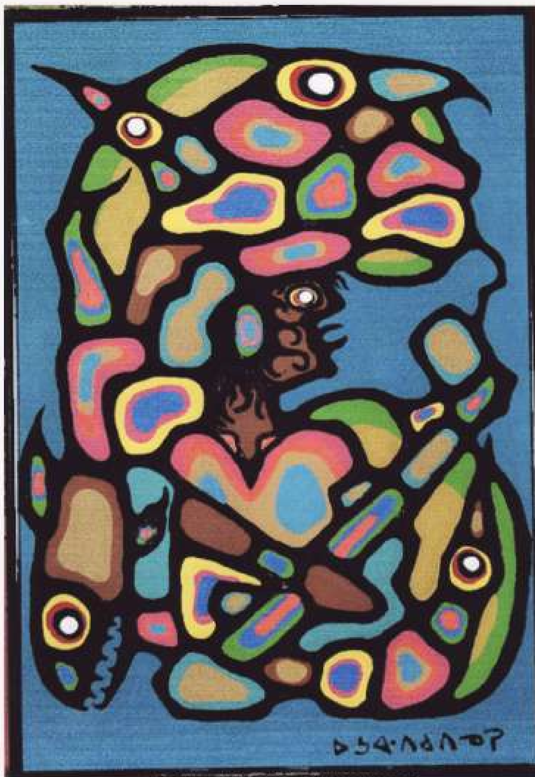
ARTIST: NORVAL MORRISSEAU SIZE: 41"X 26.5"