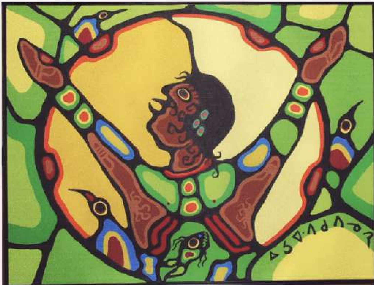
ARTIST: NORVAL MORRISSEAU SIZE: 47" X 59"