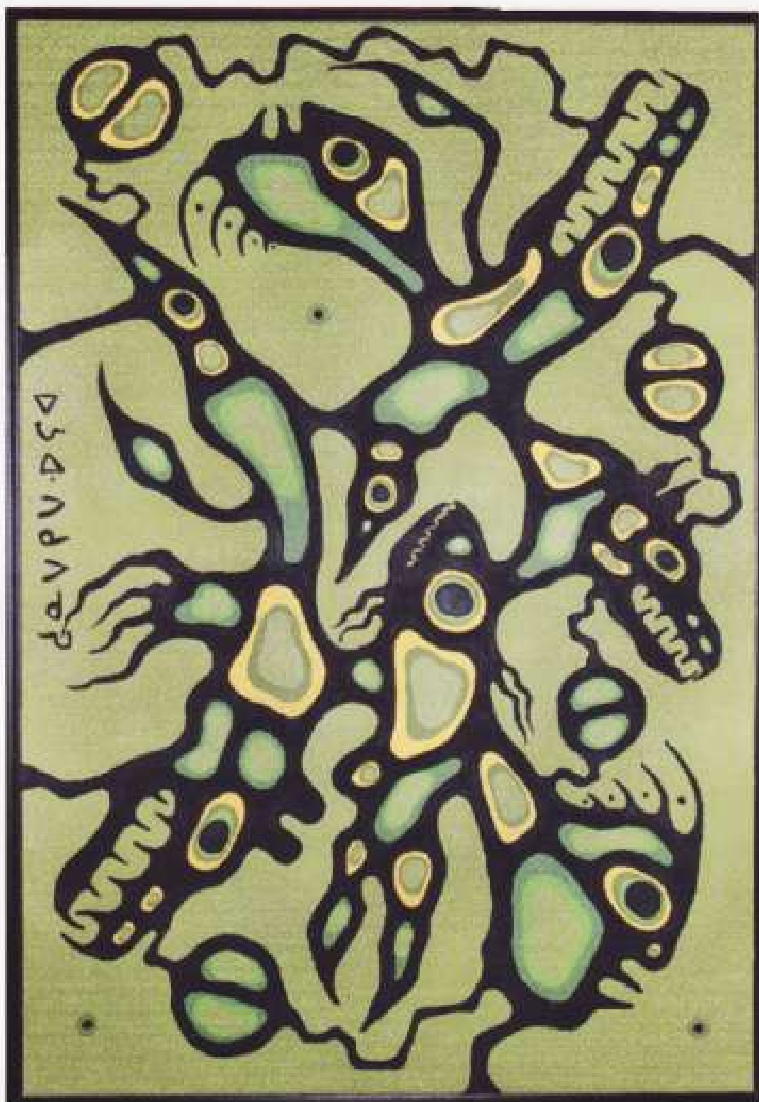
ARTIST: NORVAL MORRISSEAU SIZE: 33.5" X 52"