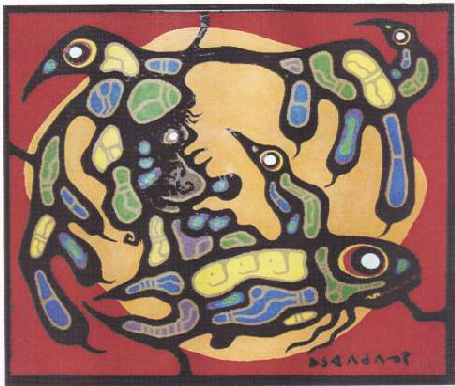
ARTIST: NORVAL MORRISSEAU SIZE: 33.5" X 38.5"