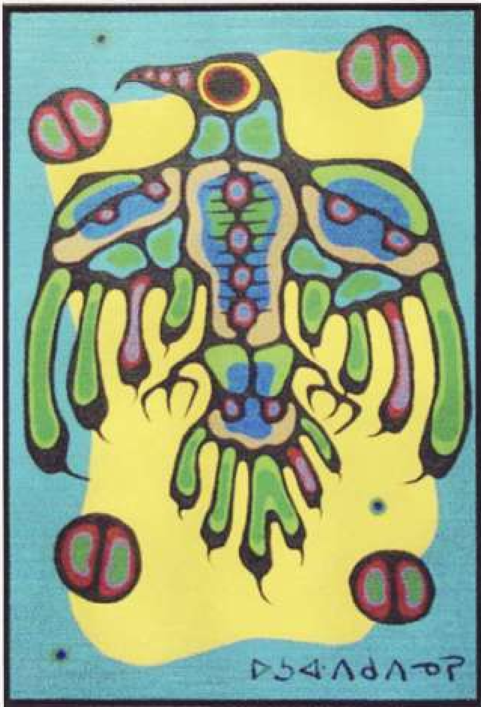
ARTIST: NORVAL MORRISSEAU SIZE: 44" X 30"